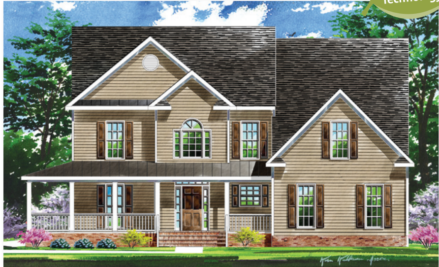
This two-level single family custom home includes numerous innovative amenities while maintaining Piedmont Realty & Construction's commitment to earth friendly building.

The Berkeley is focused around what today's homeowners want—quality construction featuring such earth friendly features as Energy Star rated appliances, Trane® High Efficiency HVAC systems, Energy Star rated tankless hot water heaters, sprayed foam insulation, custom kitchens with furniture grade cabinetry, granite countertops, stainless steel appliances, and great looking, architecturally authentic exteriors. You asked, we listened. We build distinctive homes for real lifestyles—think superior quality, think higher standards, thinkpiedmont.com