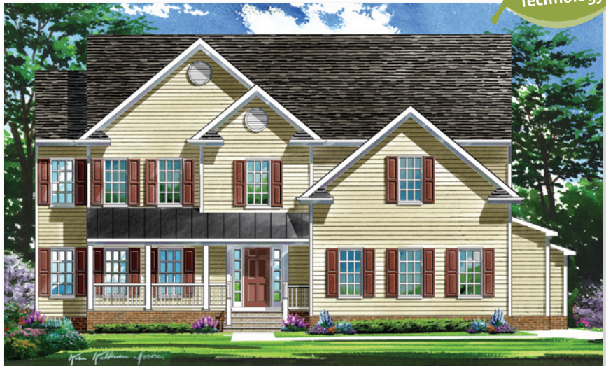
This multi-level single family custom home includes numerous innovative amenities while maintaining Piedmont Realty & Construction's commitment to earth friendly building.

The Somerset is focused around what today's homeowners want—quality construction featuring such earth friendly features as Energy Star rated appliances, Trane® High Efficiency HVAC systems, Energy Star rated tankless hot water heaters, sprayed foam insulation, custom kitchens with furniture grade cabinetry, granite countertops, stainless steel appliances, and great looking, architecturally authentic exteriors. You asked, we listened. We build distinctive homes for real lifestyles—think superior quality, think higher standards, thinkpiedmont.com